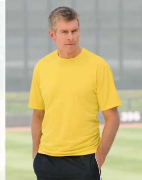
Z500 -- Boulder