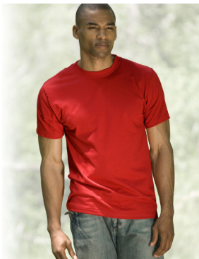
Z100 – The Zorrel Tee

The Insect Shield collection will include eight styles (2 men's polos, 2 women's polos, and 4 technical tees) available as of January 2009.